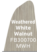
Weathered White Walnut FB300700 MWH