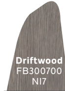
Driftwood FB300700 NI7