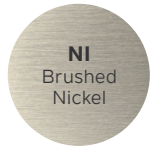
NI Brushed Nickel