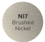
NI7 Brushed Nickel