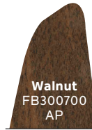
Walnut FB300700 AP

Blade Finish & Part Number (Side 1) Fan Finish (Reversible)