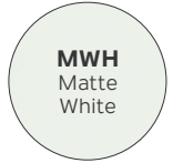
MWH Matte White