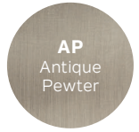
AP Antique Pewter